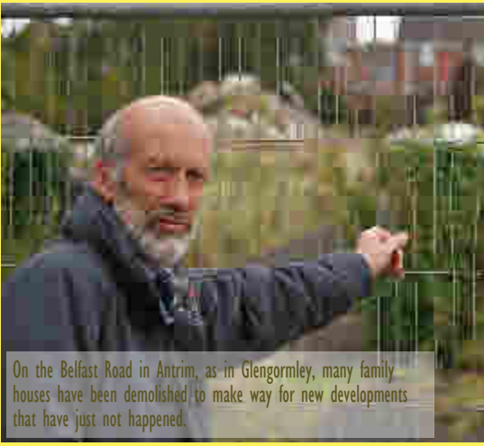
On the Belfast Road in Antrim, as in Glengormley, many family houses have been demolished to make way for new developments that have just not happened.

redevelopment but with no sign of that development going ahead.