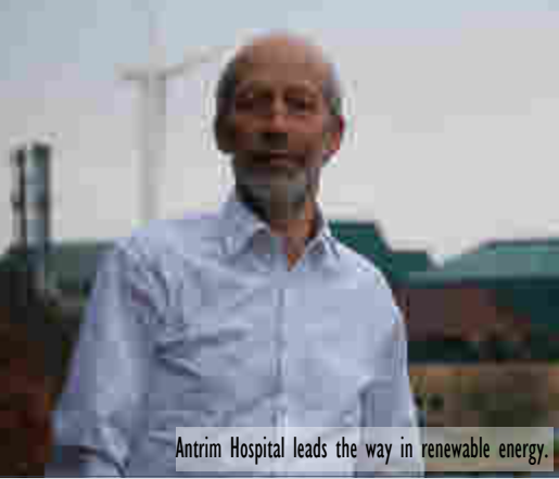
Antrim Hospital leads the way in renewable energy.