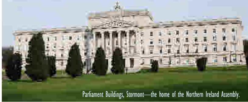
Parliament Buildings, Stormont—the home of the Northern Ireland Assembly.

Committees play an important role in advising and assisting Ministers on matters within their responsibility. The Committees also undertake scrutiny, policy development, and consultation roles with respect to Northern Ireland departments and play a key role in the consideration and development of legislation.